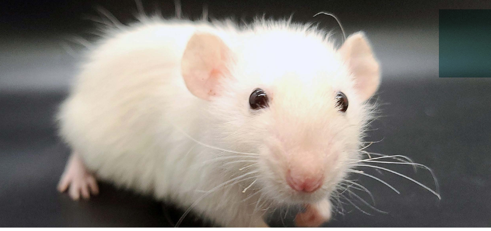
BLEUMING TAILS RATTERY BLACK EYE HIMALAYAN HARLEY DUMBO